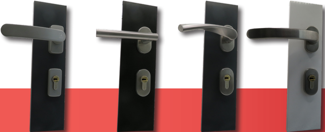
ELÄN STAINLESS STEEL