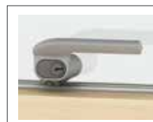
Espagnolette with cylinder lock

All espagnolettes can be supplied with a lock and key for extra security or with a child-lock button.