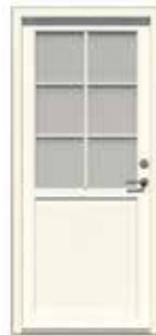
Top multi lights and one bottom panel