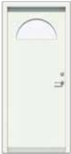
Plain with half round glass