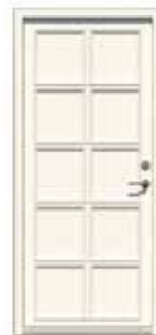
Multi lights door