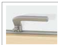
Espagnolette with lock