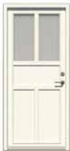
Two top lights and bottom panels