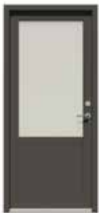
Glazed door with 1 panel