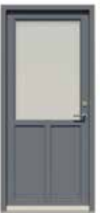
Glazed door with 2 bottom panels