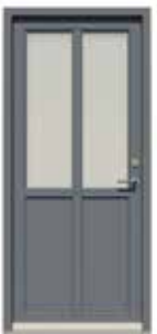
Two top lights and 2 bottom panels