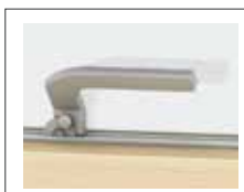
Espagnolette with child-lock