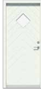
Fishbone with diamond glass